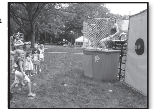
Dunk Tank Day 2011